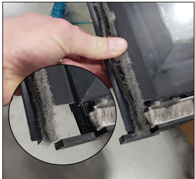
Figure 1 Interlock shown with weatherstrip already installed.

1. If not done already, install your new interlock. Orient the notched end toward the bottom to fit around the leveling block end cap.